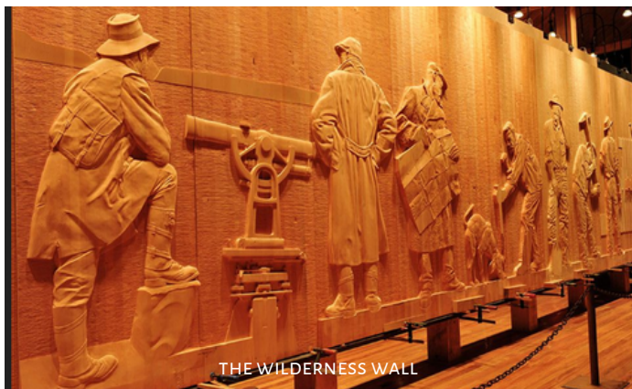
THE WILDERNESS WALL

You must arrange your own accommodation bookings. See accommodation information on page 6.