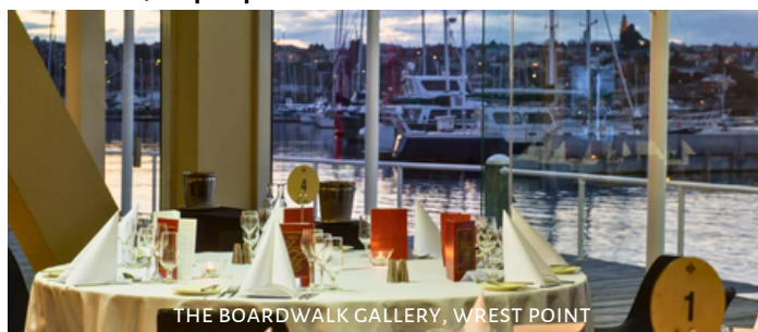
THE BOARDWALK GALLERY, WREST POINT