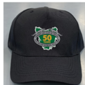
Cap - Black Only