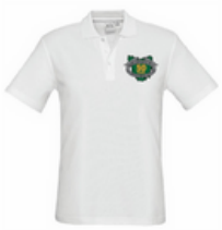
Polo Shirt - White

Further enquiries to Lyn Williams 0448 618 210.