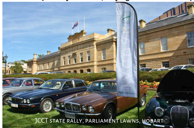
JCCT STATE RALLY, PARLIAMENT LAWNS, HOBART

Cars will be marshalled to designated parking positions and need to be in place by 10:00am, staying until at least 3:00pm.