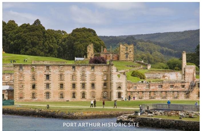
PORT ARTHUR HISTORIC SITE

8.30am - Depart Wrest Point: 10.00am - Arrive Dunalley for morning tea/toilet stop. 10.45am - Depart Dunalley 11.30am - Arrive Port Arthur 12.00pm - Guided convict site tour, walking (45 minutes) 1.00pm - 2.00pm - Lunch at Port Arthur Cafe (PAYG) 2.30pm - 20 minute harbour cruise around Point Puer and the Isle of the Dead Depart Port Arthur in time to arrive back at approx 5.00pm