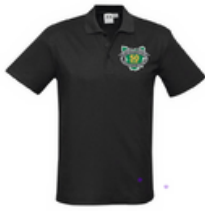
Polo Shirt - Black