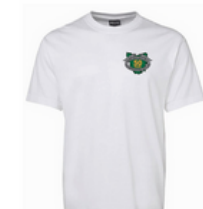
T-Shirt - White