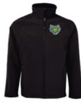
Jacket - Black Only