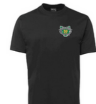
T-Shirt - Black