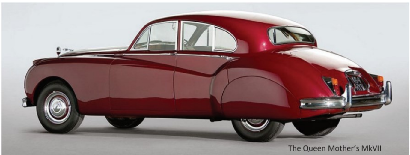
The Queen Mother's MkVII

The Nine only lasted three years but by the time it was replaced by the Mark X more than 10,000 had been sold.