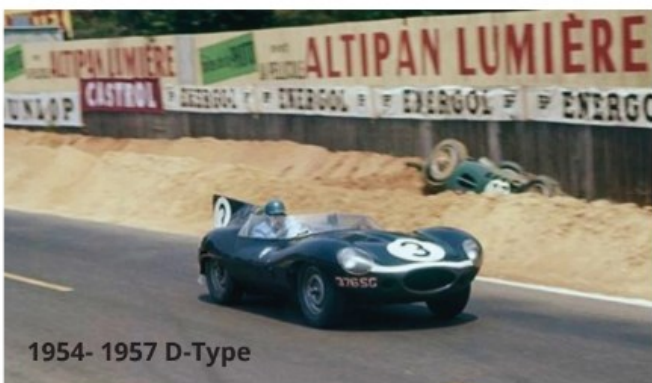
1954- 1957 D-Type