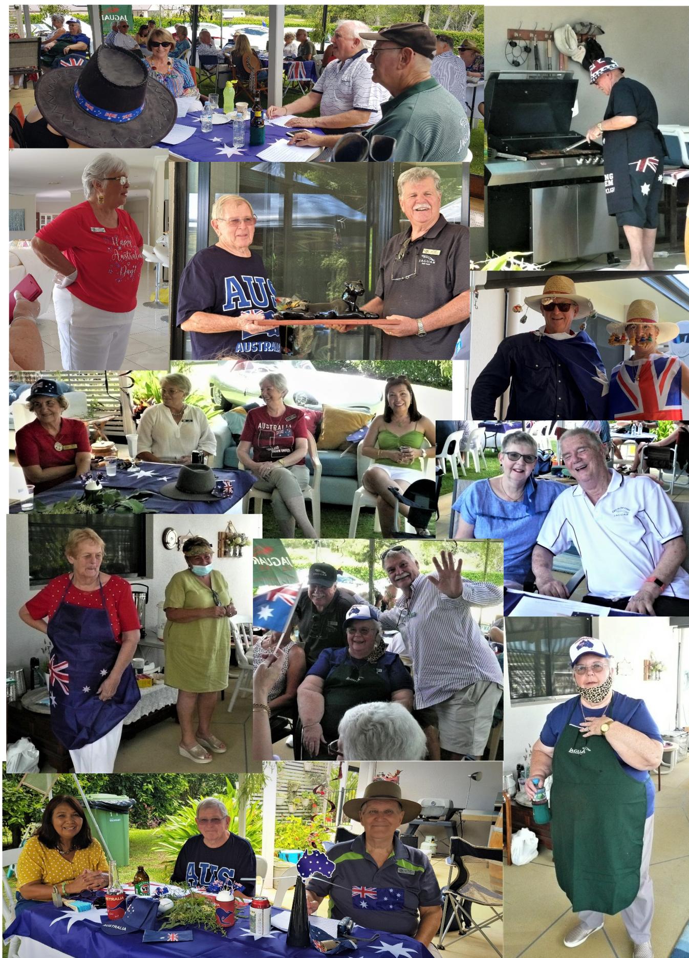
Australia Day at the Porters'