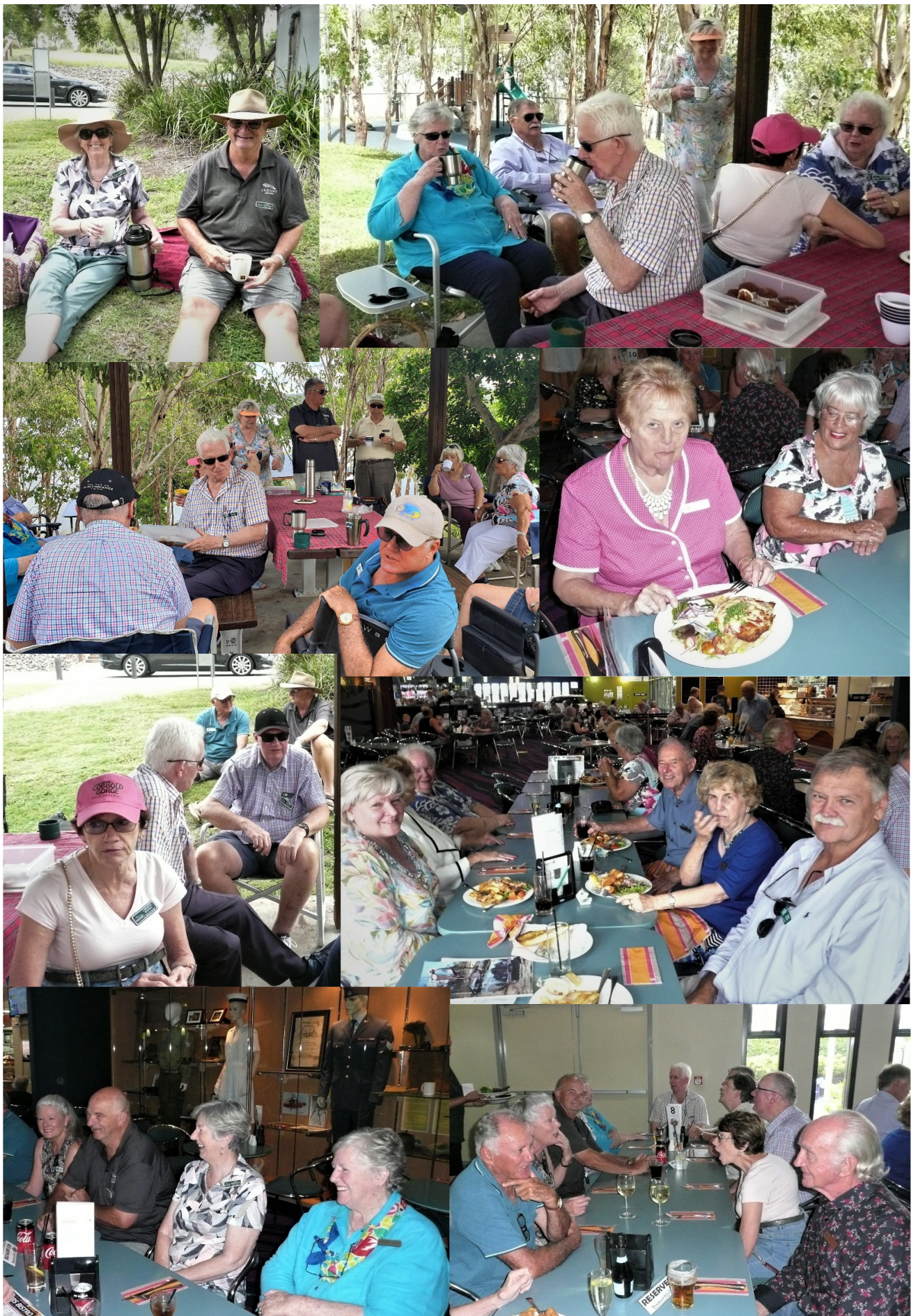
Wednesday Lunch Run to Beaudesert RSL