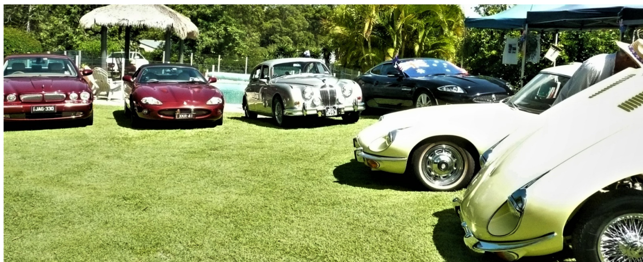
Some of the Cars on Display on Australia Day