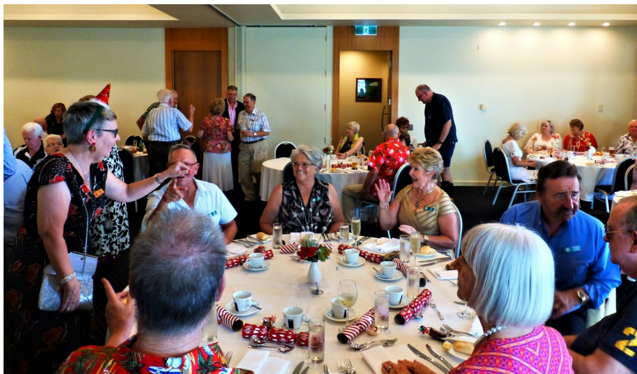
Christmas Party at the Glades in Robina