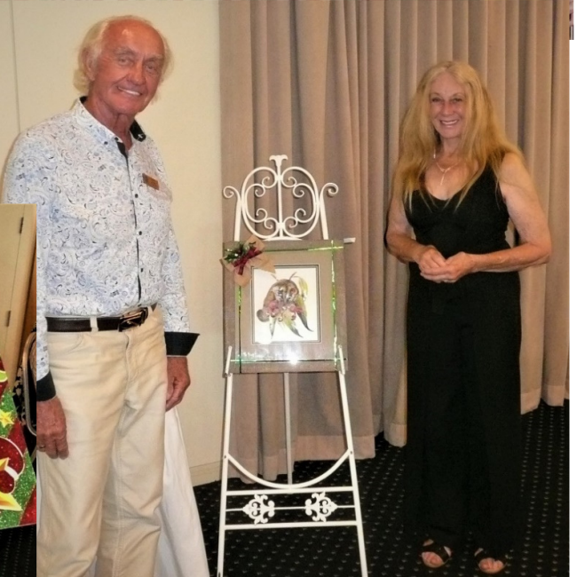
Members at the Christmas Party