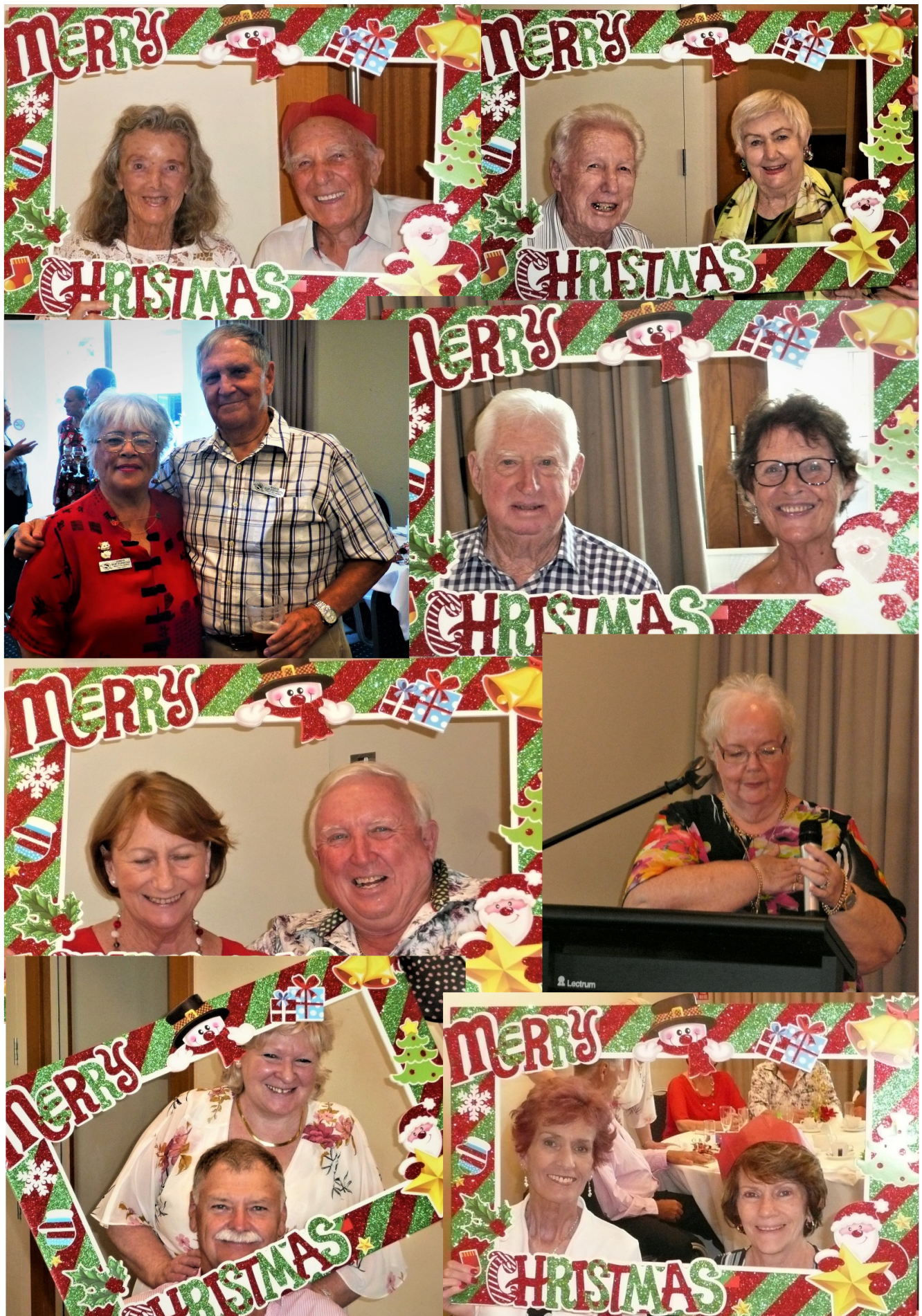
Members at the Christmas Party