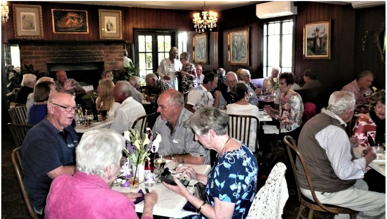
The Spring Affair at the Manor, Tamborine Mountain