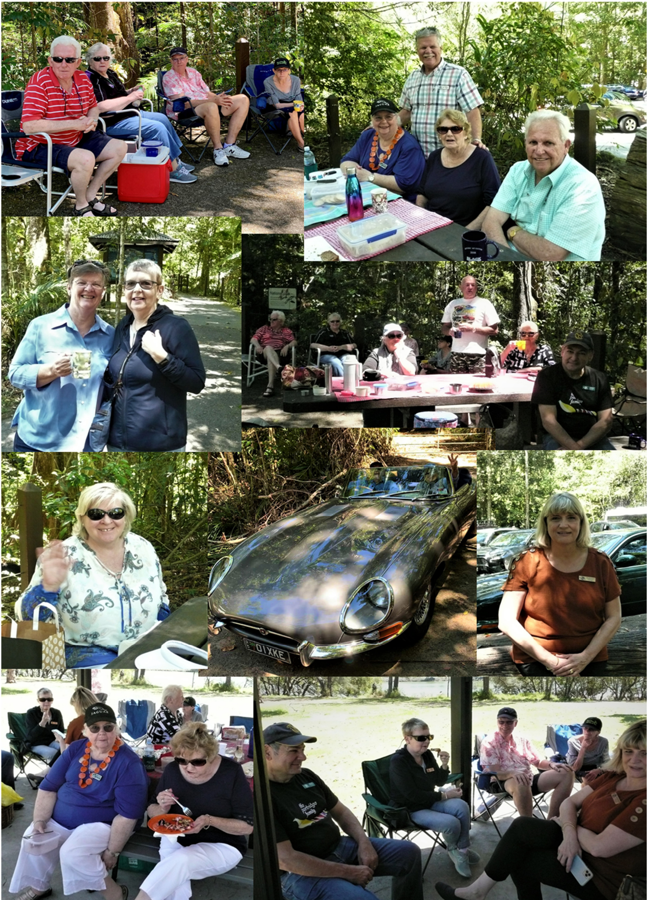
Picnic Brunch in the Currumbin Valley