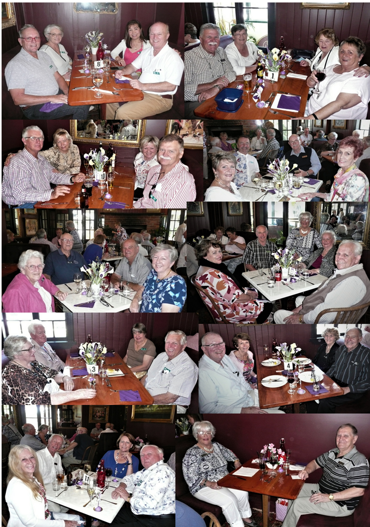
The Spring Affair at the Manor Restaurant