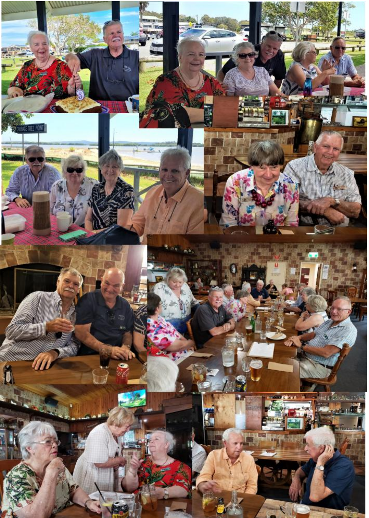
9 th Anniversary Run to the Bearded Dragon Hotel