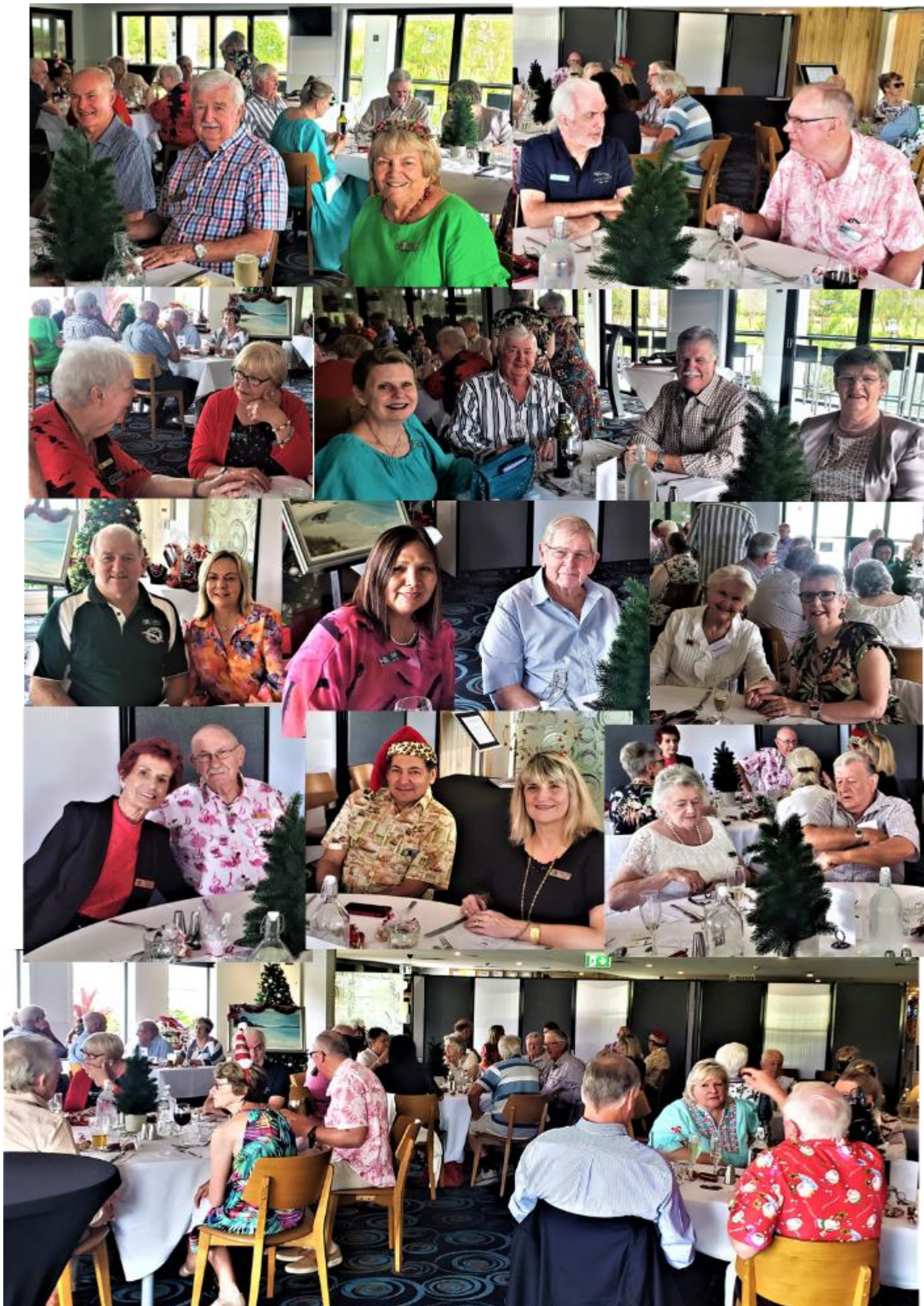
Christmas Party at Emerald Lakes Golf Club