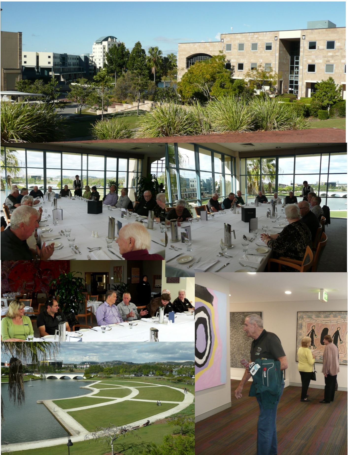
Visit to Bond University