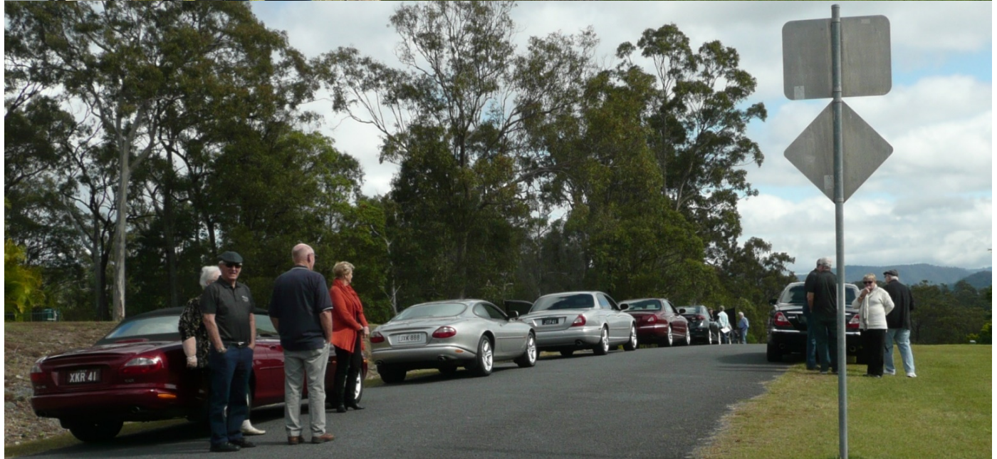
Wednesday Run Through Gold Coast Hinterland 2