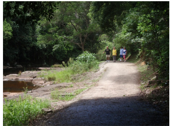
Pleasant stroll before lunch