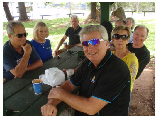
Morning tea at Lemon Park