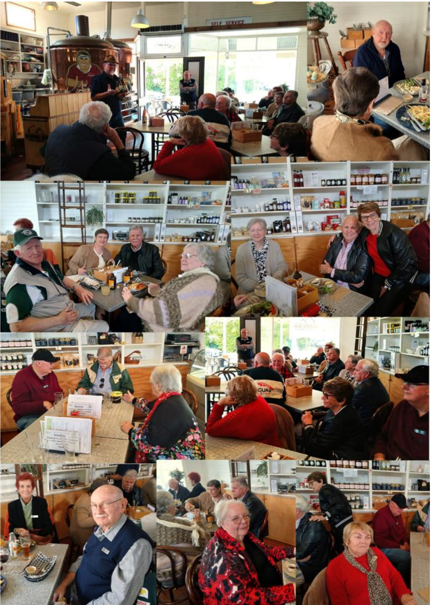
Lunch at the Scenic Rim Brewery, Mt. Alford