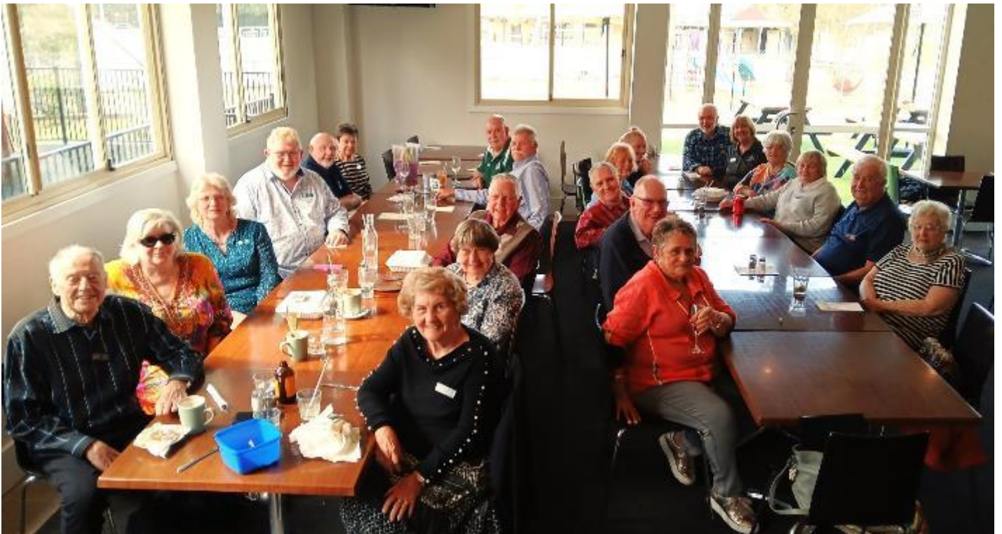
Lunch at the Shearers Arms Tavern in Ormeau