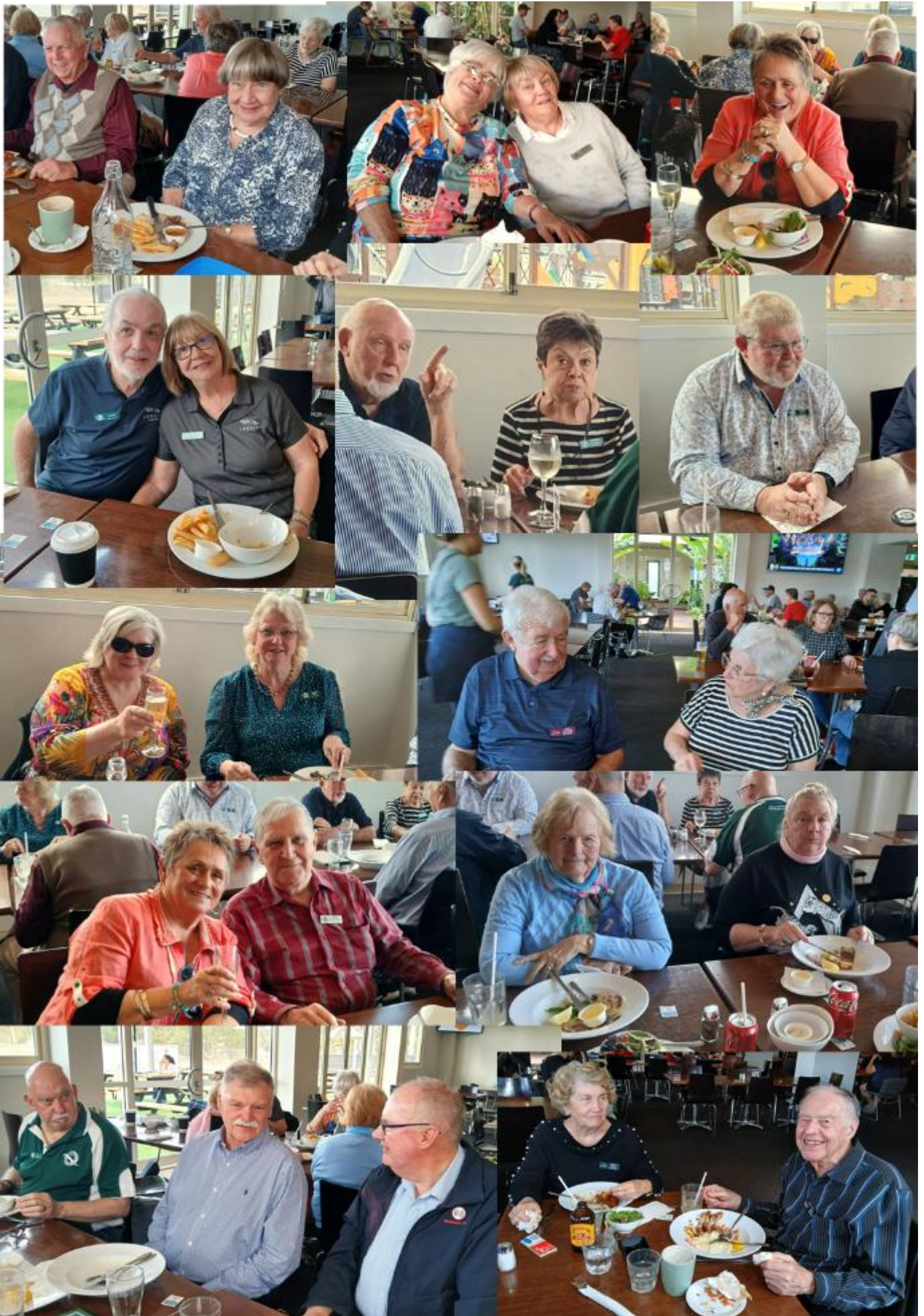
Lunch at the Shearers Arms Tavern in Ormeau