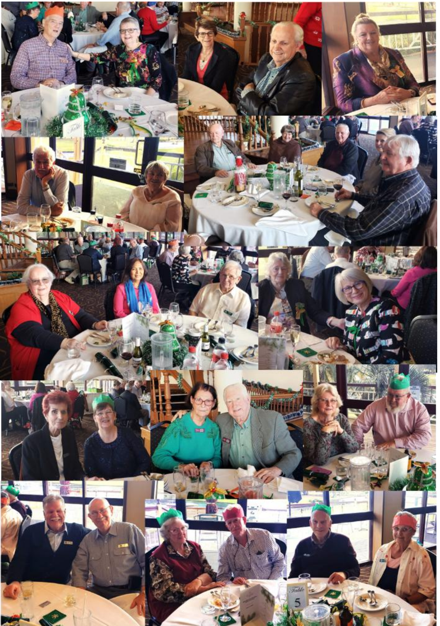
Christmas in July at the Palmer Colonial Golf Club