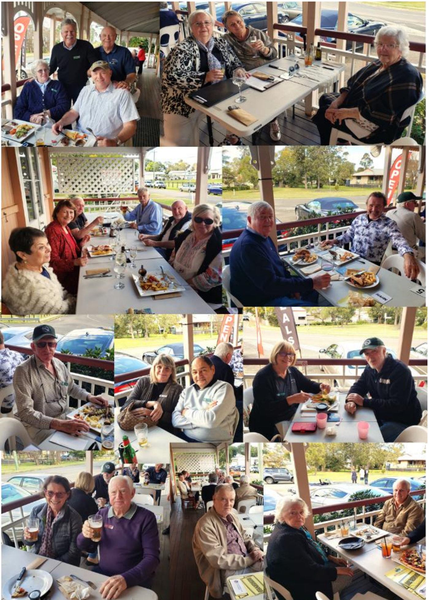
Lunch at the Royal Harrisville Hotel