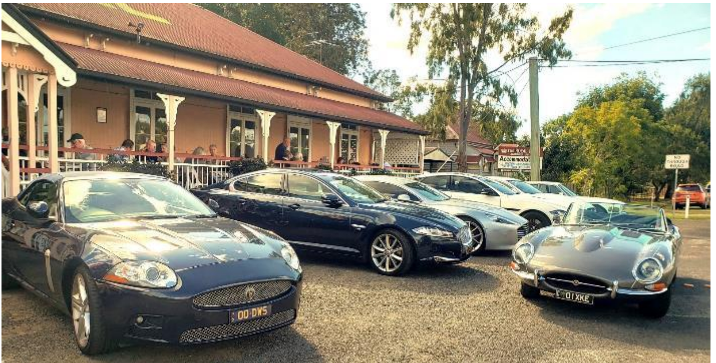
Jaguars and an Aston Martin at the Royal Hotel Harrisville