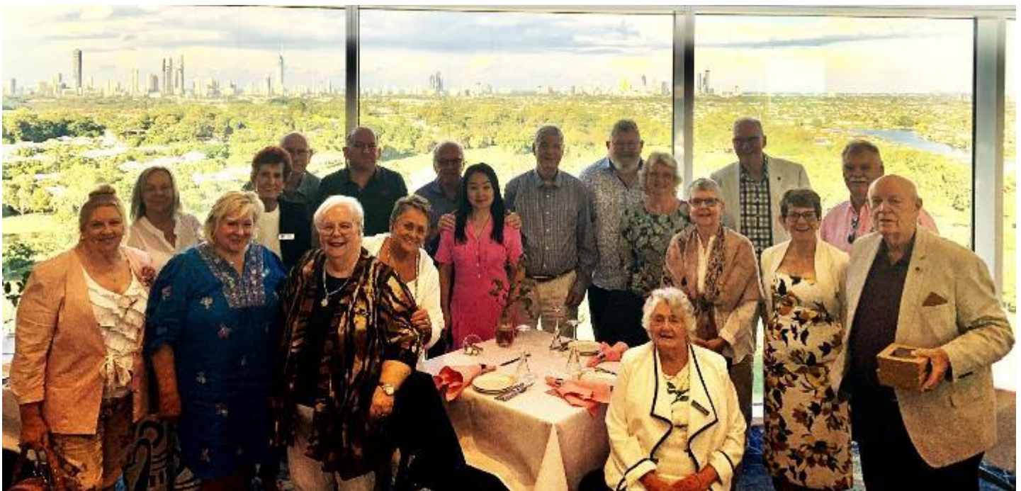
Members Enjoying High Tea at the Royal Pines Golf Club