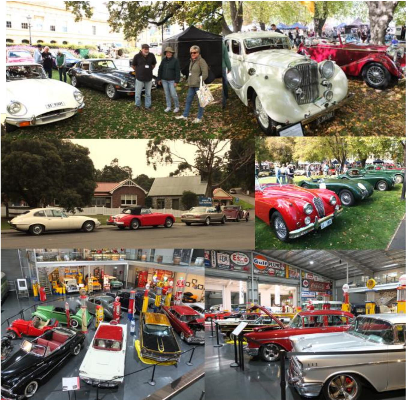
Highlights of National Rally Tasmania