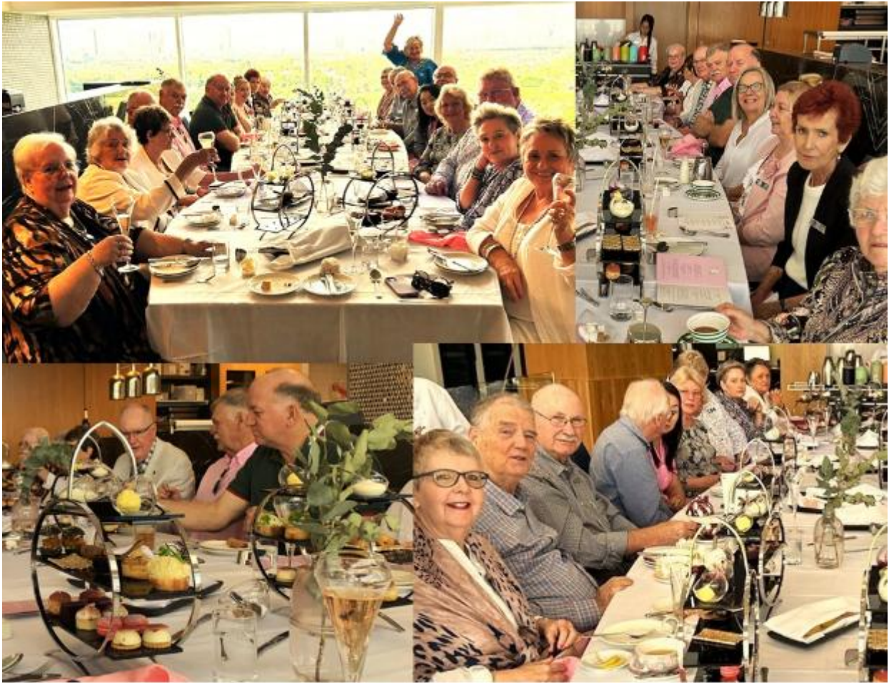
High Tea at the Royal Pines Golf Club