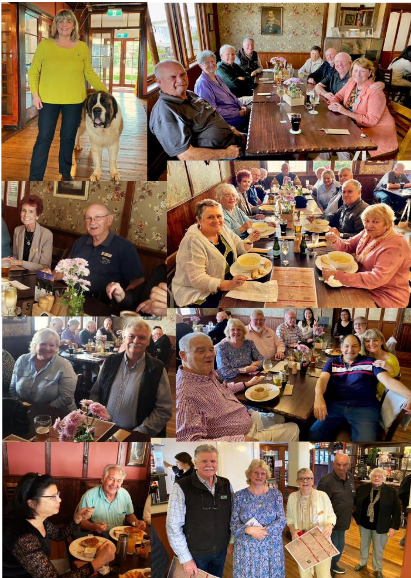
Saturday Lunch at St. Bernard's Hotel Mt. Tamborine