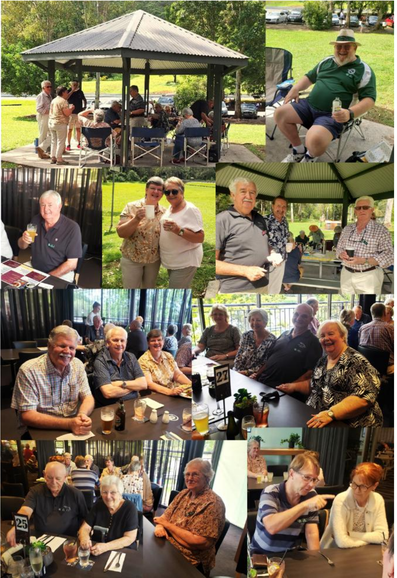
Sunday Run to Murwillumbah RSL