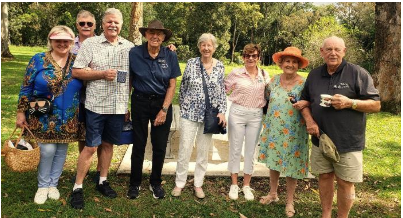
Morning Tea at Bochow Park, Natural Bridge

This Year's Christmas in July will be held early, on the 7 th July. See page 3 for details.