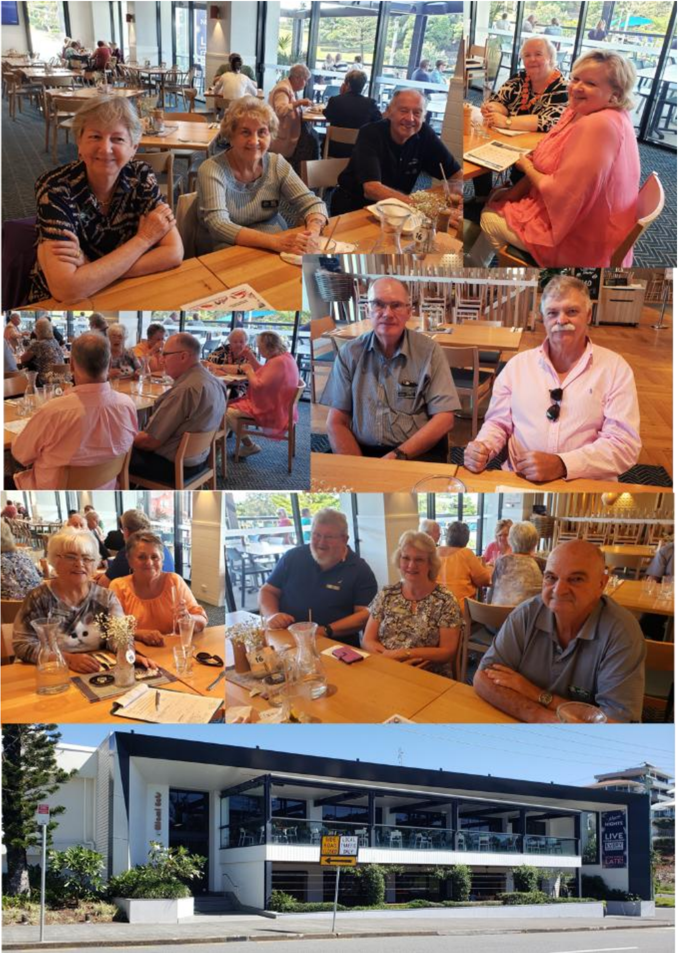
Wednesday Lunch at the Miami Tavern