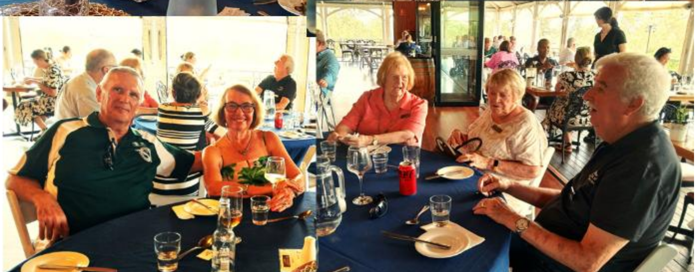
Lunch at the Albert River Winery