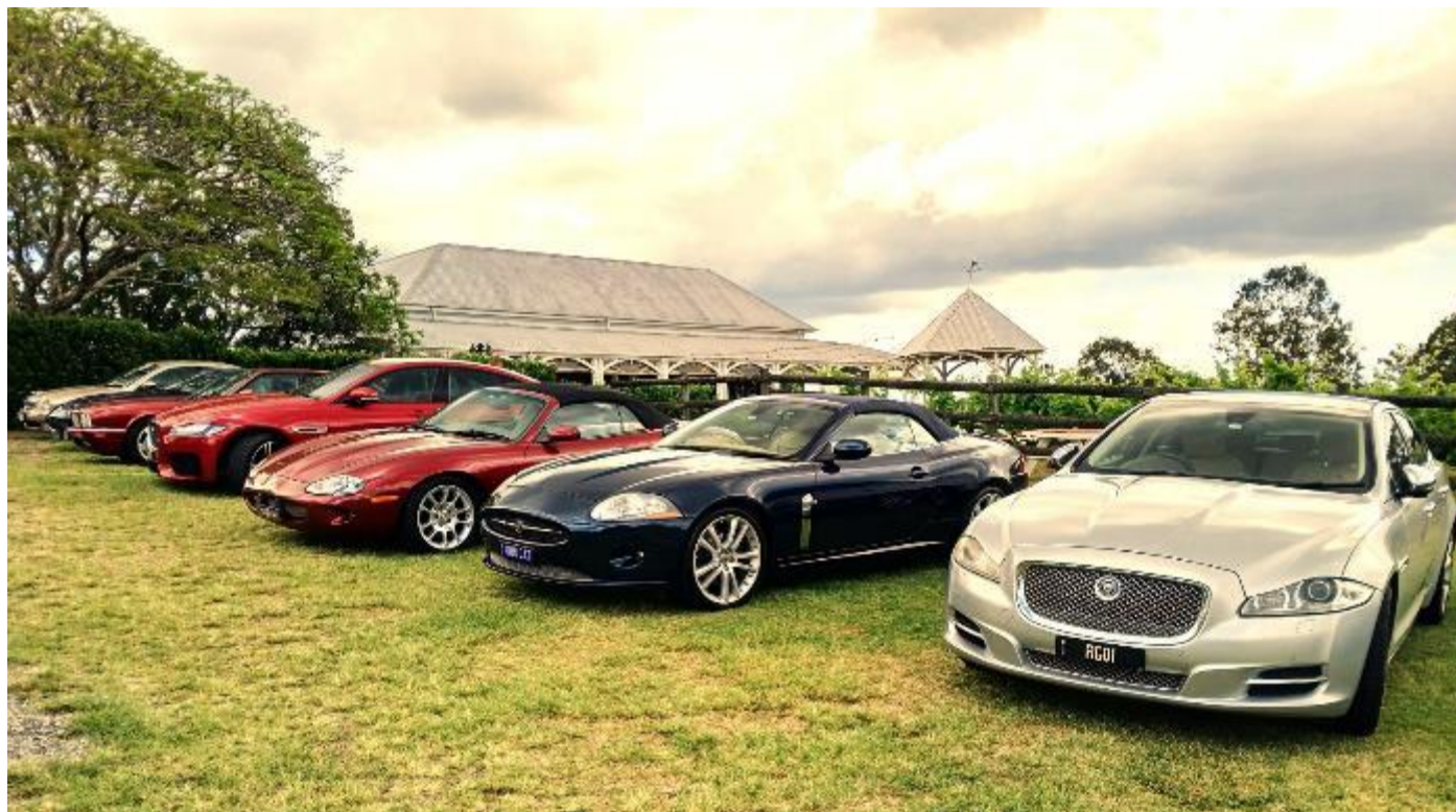
A line Up of Cool Cats at the Albert River Winery

Australia Day Celebration – see page 6 for details.