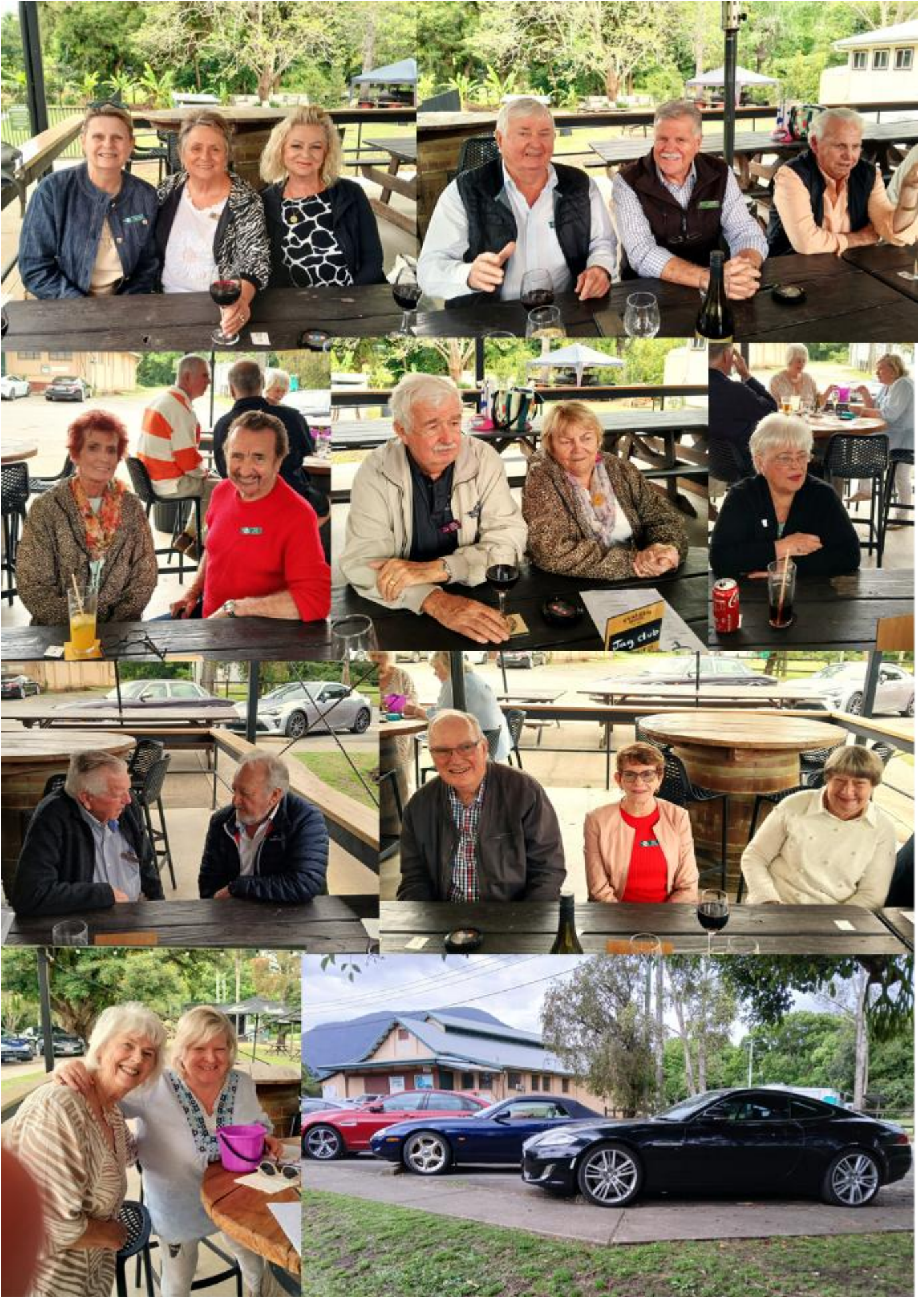
Lunch at the Tyalgum Hotel