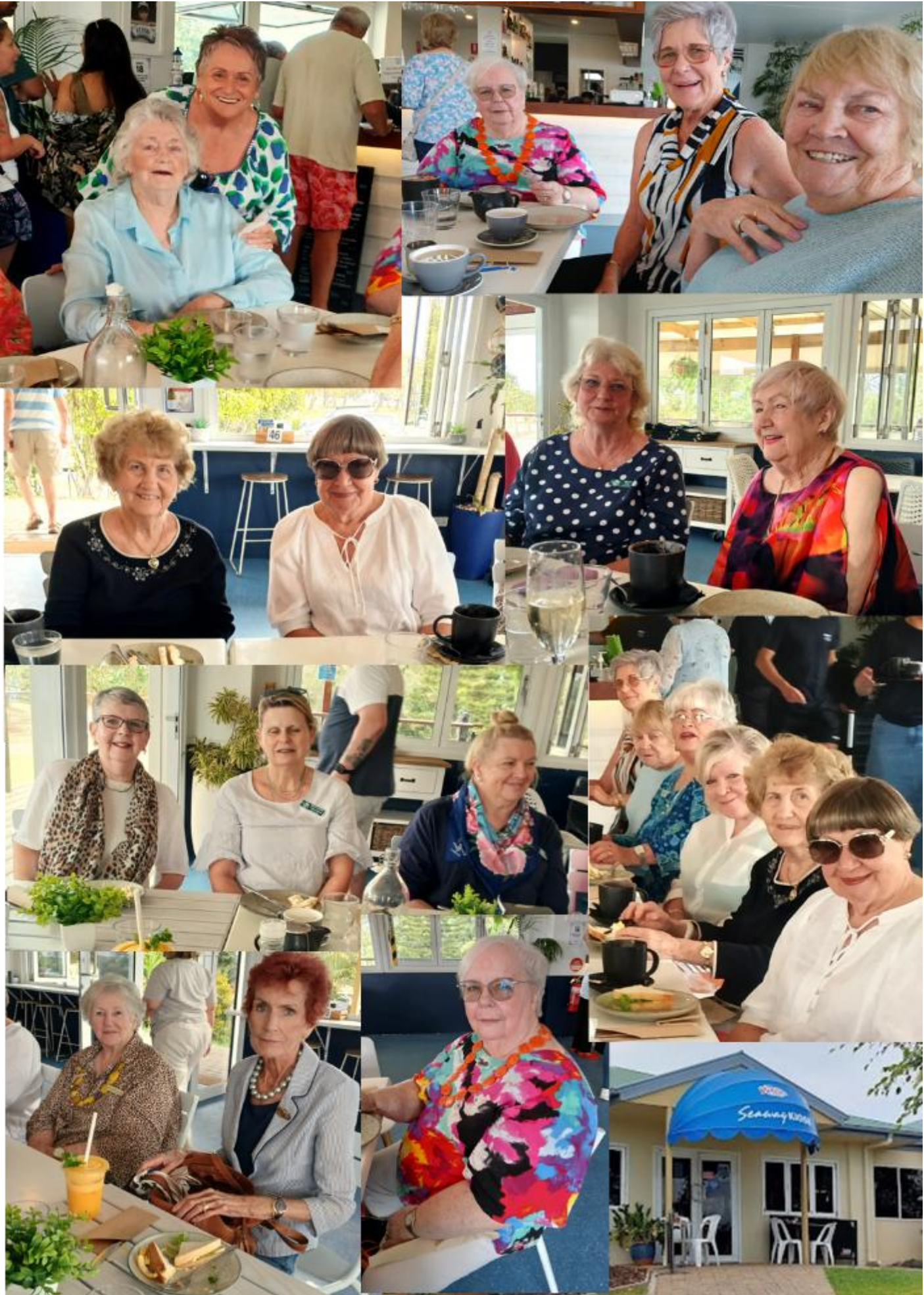
Ladies Day at the Spit