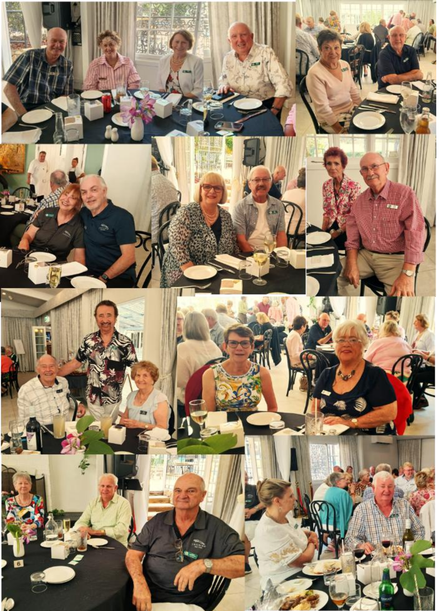
The Spring Affair on Mt. Tamborine