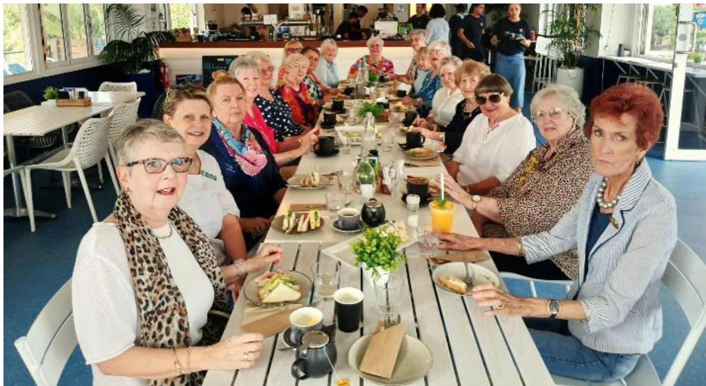
Ladies Day at the Spit Cafe