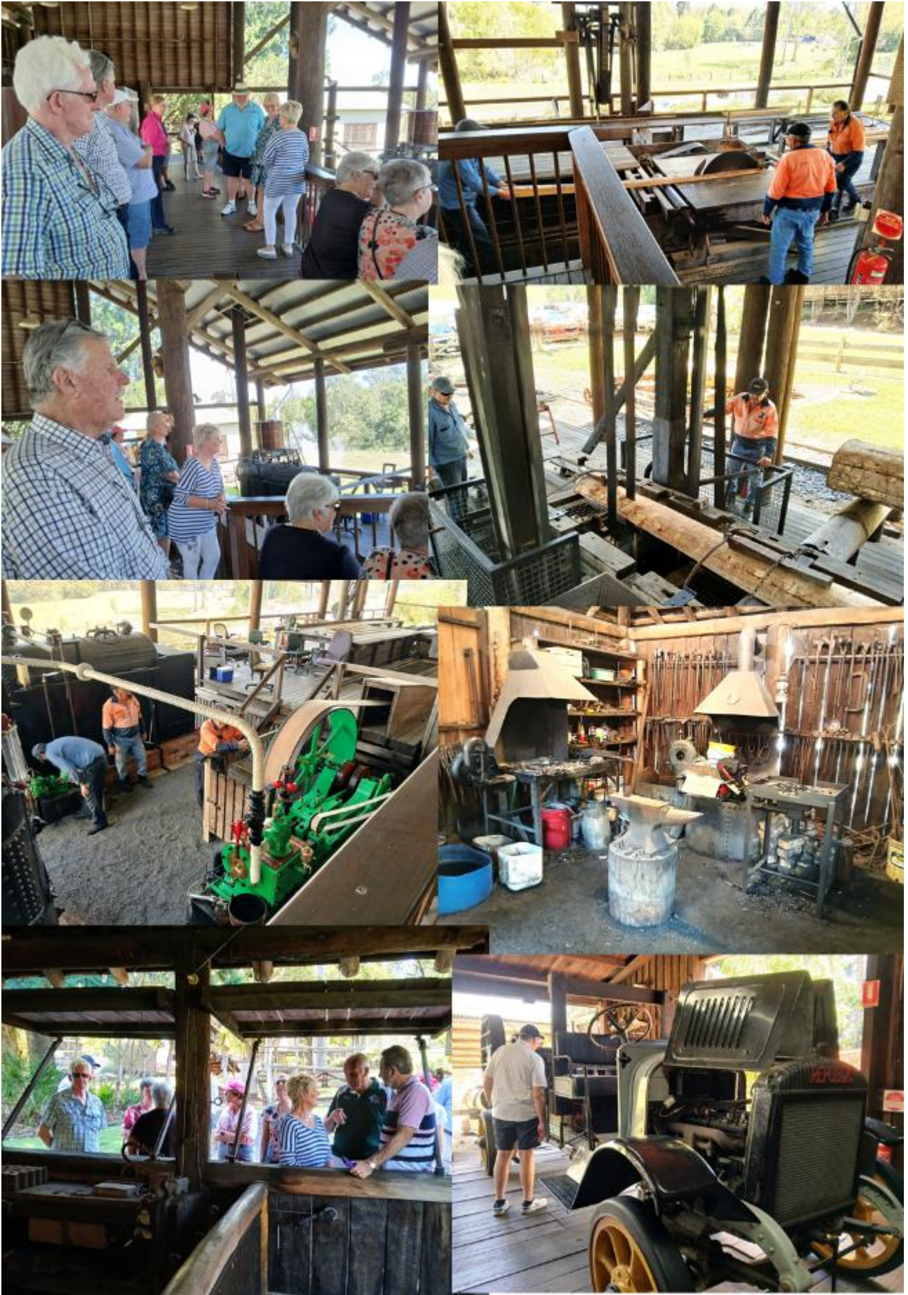
The Gympie Woodworks Museum