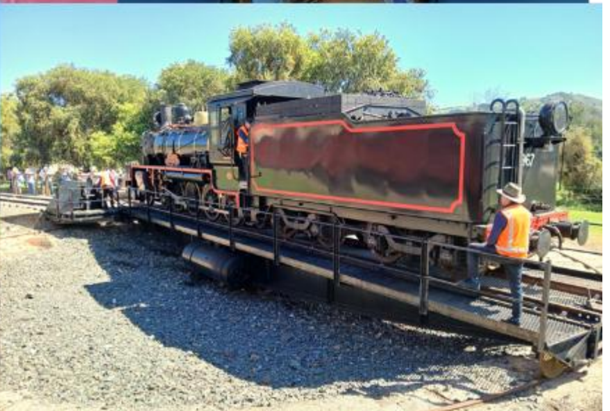
The 'Red Rattler' Trip in Gympie