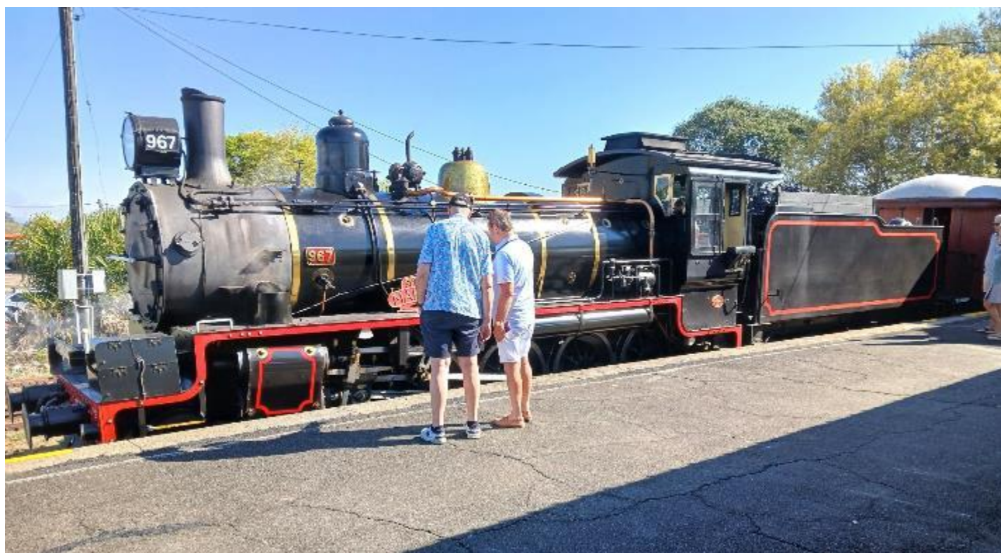
'Spirit of the Mary Valley' Steam Engine (The Red Rattler)