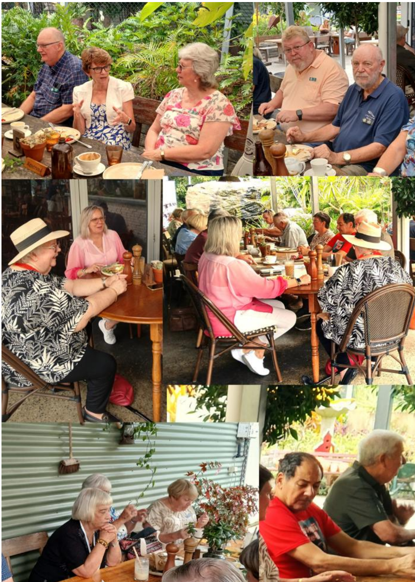
Breakfast at the Barrow Café Mt. Nathan