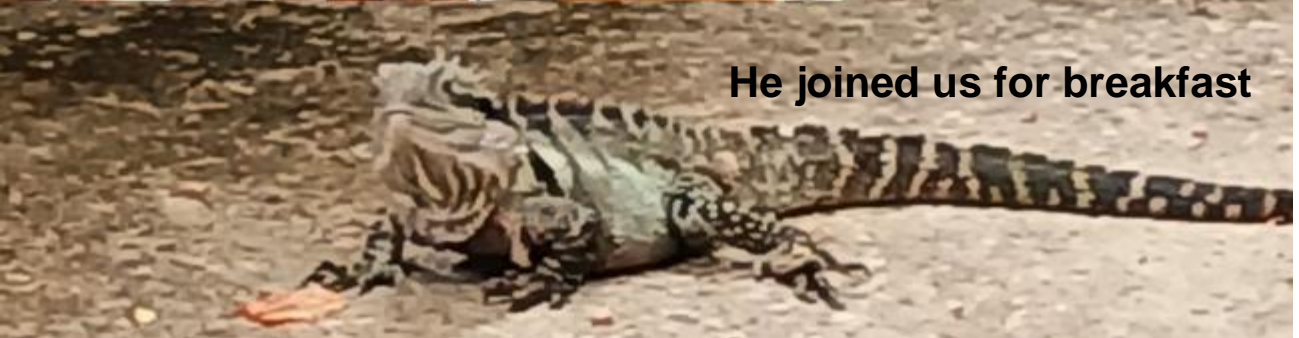
Breakfast at the Barrow Café Mt. Nathan