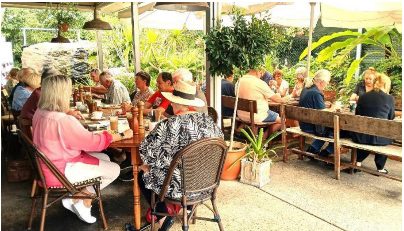
Breakfast at the Barrow Café in Mt. Natham