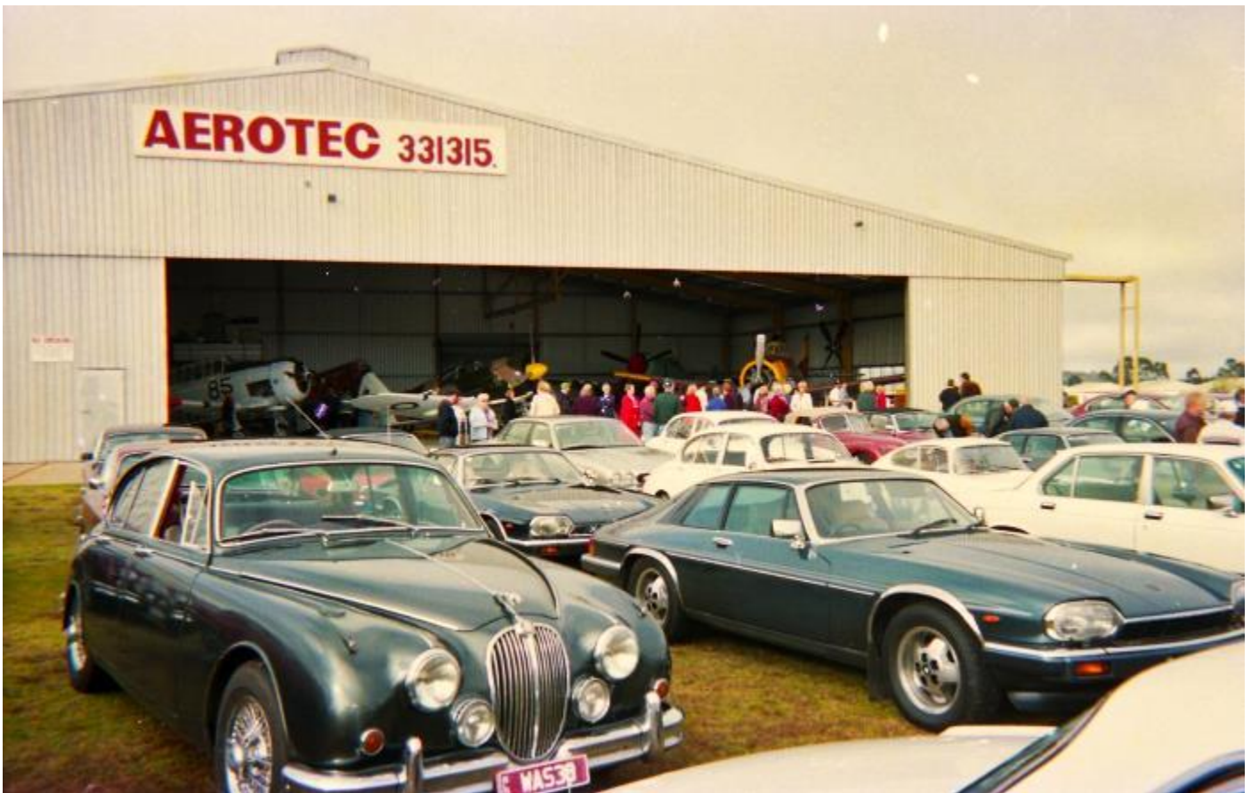
Aerotec and Car Display - June Jaunt 2001

Contact Details: Wendy Gross – secretary@jagqld.org.au Mob. 0498 203257