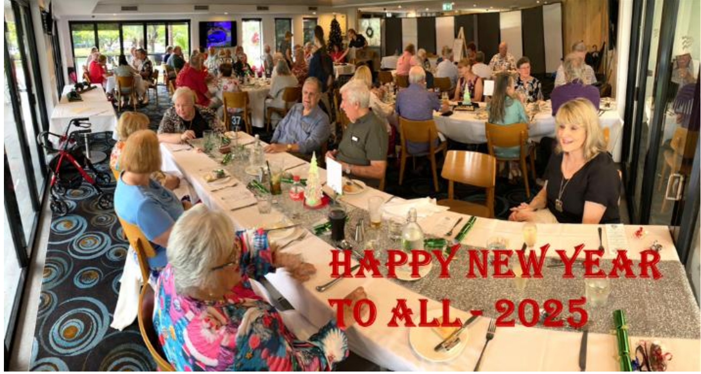
Christmas Party at the Emerald Lakes Golf Club