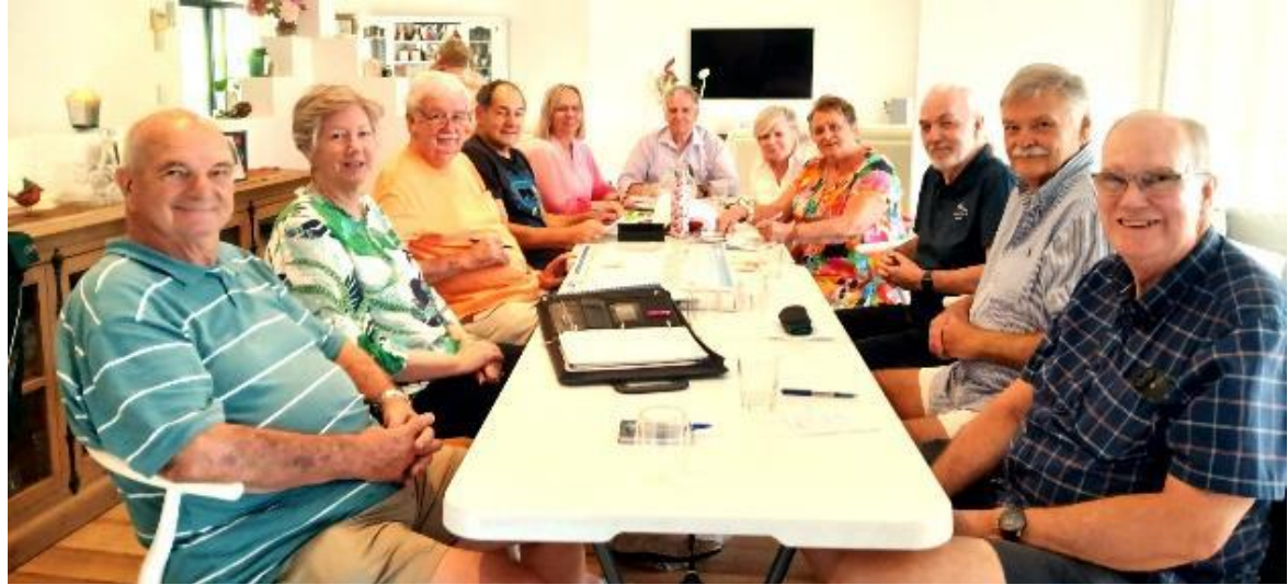
Planning the Events for 2025