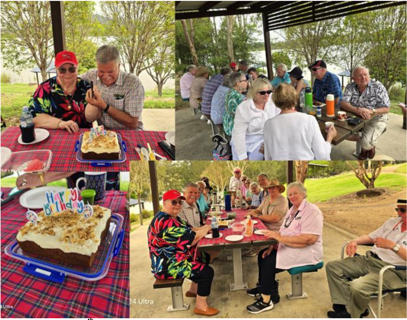
11<sup>th</sup> Anniversary of Wednesday Events at Wyralong Dam