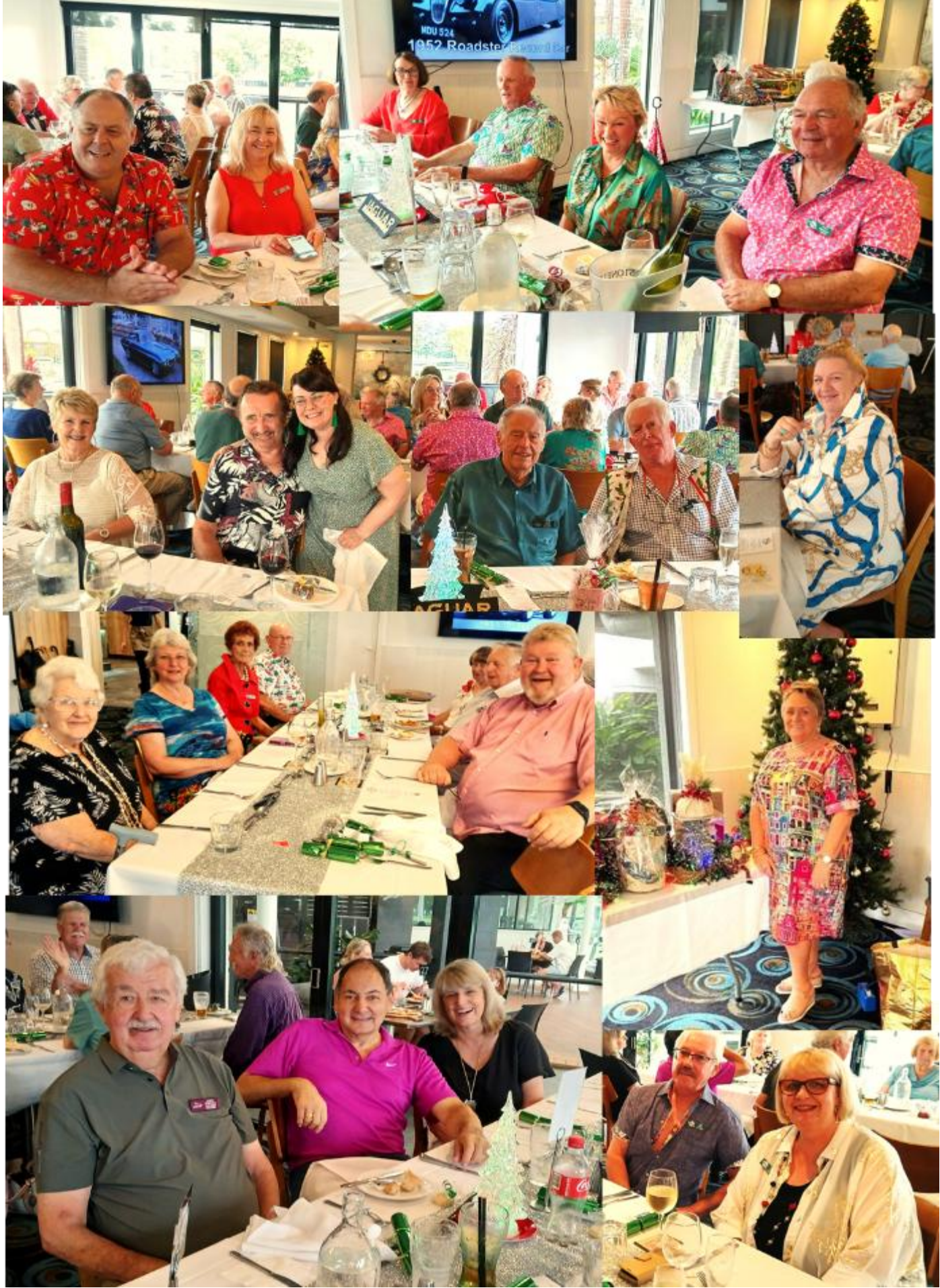
Christmas Party at the Emerald Lakes Golf Club